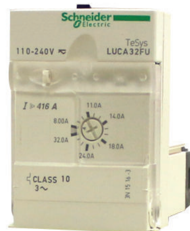
Interchangeable Overload Module