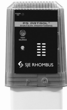
Shown with Mounting Post U.S. Patent Nos. D 780,703 and 9,472,932

The sleek, angled design of the clear enclosure includes a removable cover for easy access for field wiring. All internal components are sealed within the cover for protection from the elements. The red LED illuminates the cover in an alarm condition for easy 360° visual identification. Available with or without 32" mounting post.